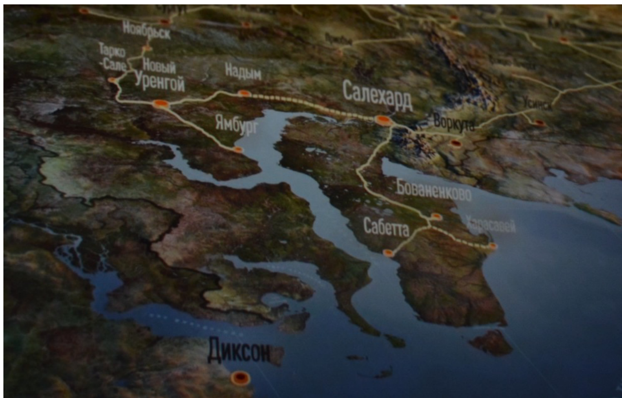
The Sabetta-Bovanenkovo railway.

According to the regional government, the project is ready for implementation and investors are at hand.